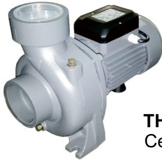
THF 6B - 3 Centrifugal Pump