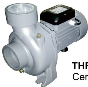
THF 5A Centrifugal Pump