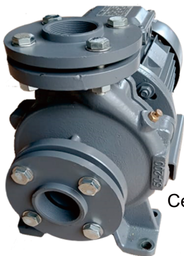
THF 150 Centrifugal Pump