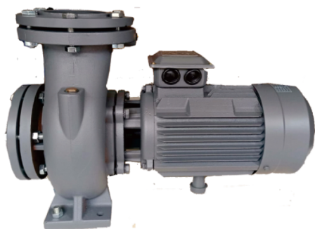
TNF 150 Centrifugal Pump