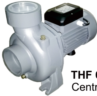
THF 6B - 1 Centrifugal Pump